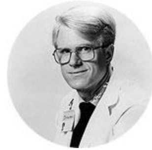
Dr. Victor Ehrlich St. Elsewhere

Inspired by the works of his Academy Award-winning father, Ed Begley, Jr. became an actor. He first came to audiences' attention for his portrayal of Dr. Victor Ehrlich on the long-running hit television series, "St. Elsewhere," for which he received six Emmy nominations. Since then Begley has moved easily between feature, television and theatre projects.