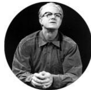
Del "The Cryptogram"

Begley also starred in the West Coast premiere of David Mamet's "Cryptogram," at the Geffen Playhouse, in the role that he first performed in Boston and then in New York. He also starred in Mr. Mamet's production of "Romance" last fall at the Mark Taper Forum.